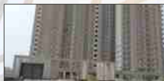
Raksha Towers, Micasa, Sec 68, Gurgaon