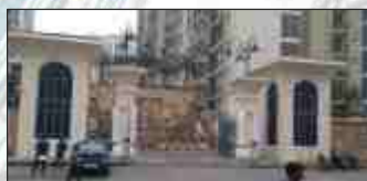
Raksha Addela, Gr Noida West