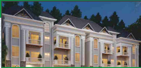
Raksha Lake County Naukuchiatal, Nainital, Uttarakhand