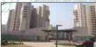
Raksha Towers, Park Serene, Gurgaon