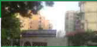
AFNOE, Dwarka, New Delhi