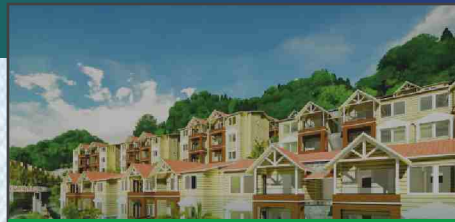
Raksha Sunny Lake Greens Sattal, Bhimtal