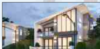
Raksha Paradise Villas, Majkhali, Ranikhet

Address: J-23, BK Dutt Colony, Jorbagh Road, New Delhi-110003