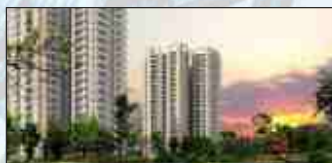
Raksha Towers, Vihaan Greens, Gr Noida West