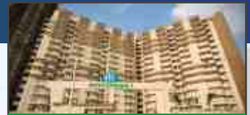
Raksha Towers, Ecovillage, Gr Noida West