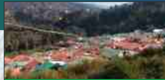
Raksha Retreat Cottages, Bhimtal, Nainital