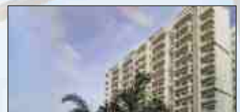
Raksha Towers, Victoria, Sec 70, Gurgaon