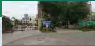
Raksha Enclave, Omega2, Greater Noida